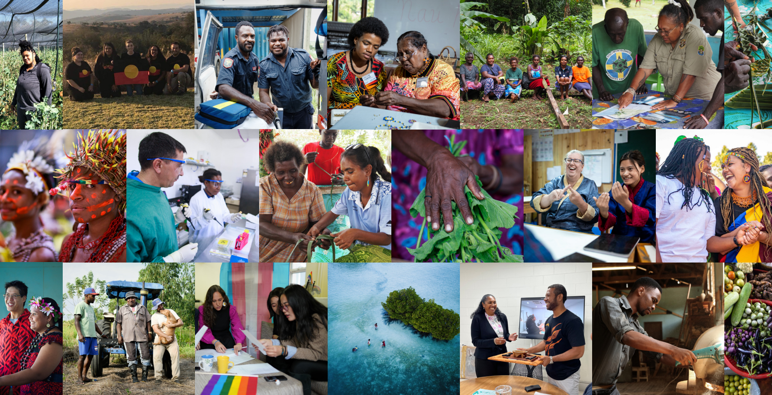
Above: Images from volunteer assignments and projects across some of the countries the Australian Volunteers Program works in. Consent obtained.

The Australian Volunteers Program, an initiative funded by the Australian Government, matches a broad range of skilled Australians with partner organisations overseas, to support these organisations to achieve their own development goals. International volunteering makes a valuable contribution to communities and organisations overseas, and helps to change lives for the better.