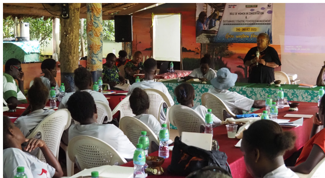
Program partner WWF and the Australian Volunteers Program at a women's forum in Solomon Islands.

We are proud to work with more than 300 community, government and not-for-profit organisations across a range of sectors.