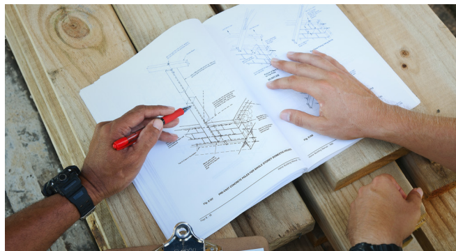
Partner organisation Ministry of Works, Transport and Infrastructure in Samoa inspecting for adherence to correct building standards at a construction site.