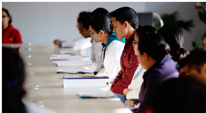
A meeting at Kathmandu University, Nepal, an Australian Volunteers Program partner organisation.